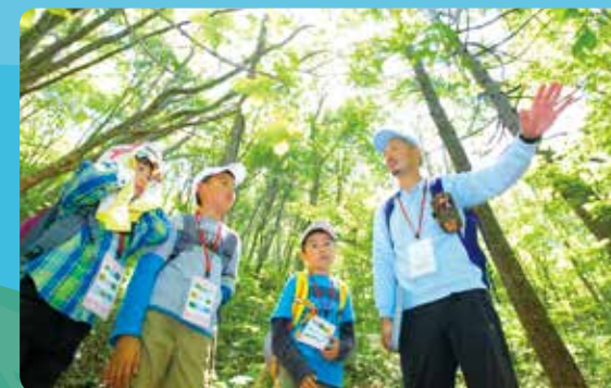
The Outdoor School of Forest and Water

Under the Suntory Mizuiku —Education Program for Nature and Water, we are helping children to understand the importance of water and the role of forests within natural water systems. Since 2004, we have given children opportunities to experience nature for themselves through the Outdoor School of Forest and Water, which is held at Hakushu in Yamanashi Prefecture,