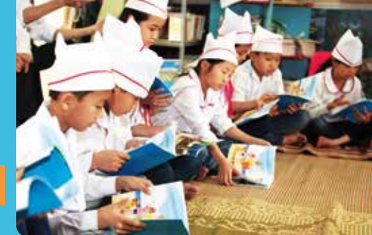
Suntory Mizuiku in Vietnam

Through these activities in regions around the world, we are diffusing the SBF belief in water conservation as the basis for living with water. Our Mizu To Ikiru promise is one we will pass on to future generations, and through a diverse range of initiatives, SBF will continue to make these ideas a reality.